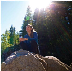
Photo Contest Celebrate the best of summer by entering Mosaic's annual photo contest! Submit your favourite images of BC's wild West Coast for a chance to win a camping pass valid at any Mosaic campsite. For details, visit MosaicForests.com/camping .