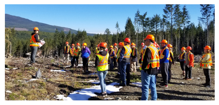
TOGETHER WITH COMMUNITY WATER MANAGERS , Mosaic hosts dozens of watershed tours each year, where members of the public can learn about management of water resources and sustainable forestry.